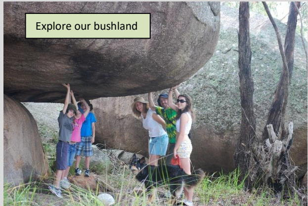
Explore our bushland