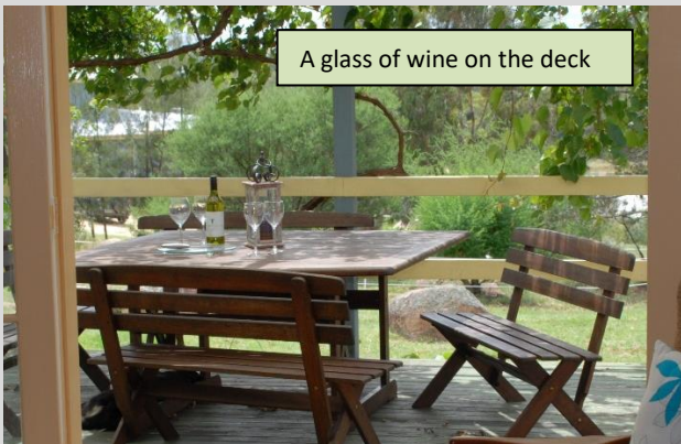
A glass of wine on the deck