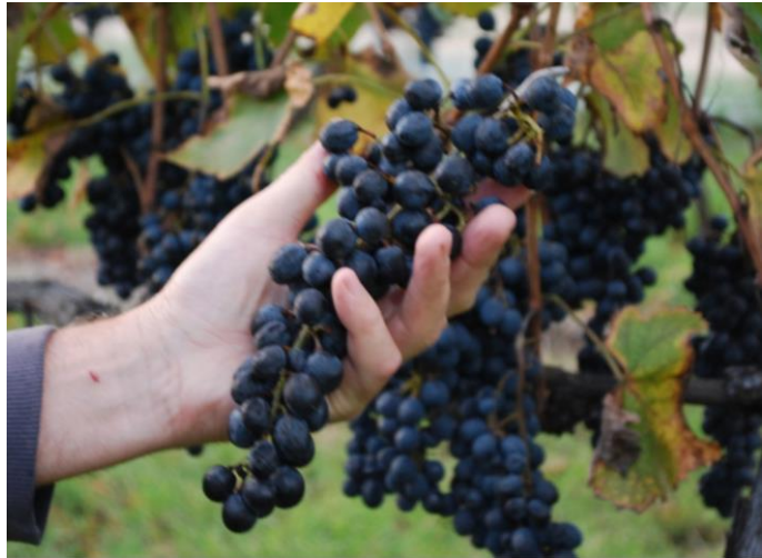
Shiraz grapes used to make our 2017 Shiraz Rosé

When we make our red wines (e.g., using Shiraz grapes) the grapes are put through a crusher-destemmer machine which gently removes the grapes from the bunch stem and then lightly crushes them so that the skin splits. We then transfer the resulting mix of juice, skins and seeds (known as must ) into a tank where we add yeast and ferment the must for approx. 7-10 days until all sugars are converted into alcohol. The dry tannins and dark colour typical of a red wine is derived from this extended contact with the skins. When the ferment is finished we then transfer the fermented must into a press where the skins and seeds are removed and taken to our mulch heap for composting. The wine is then matured for approx. 12-14 months before being fined, filtered and bottled.