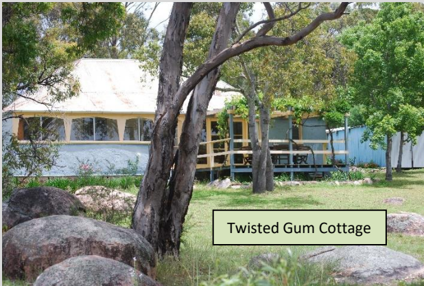
Twisted Gum Cottage

To celebrate the arrival of this beautiful weather in the Granite Belt we have decided to create a special Cool Summer Promotion for Twisted Gum Cottage, where if you stay for two nights the third night is free! You can enjoy a fabulous cool summer escape in Twisted Gum Cottage, surrounded by lush green vineyards and rugged native forest. Our vineyard is located at an altitude of 900 metres at one of the highest points in spectacular Granite Belt Wine Country, where summer days are sunny and mild and the nights are cool and crisp. You can explore the 30+ award winning cellar doors and boutique olive groves, cheese producers, restaurants, fresh fruit and vegetable stalls and the breathtaking Girraween National Park. Or you could simply sit on the deck with a glass of wine and enjoy the peace and quiet. ☺